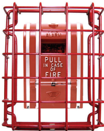
Guard pictured with Edwards Systems Technology SIGA-270 Fire Alarm