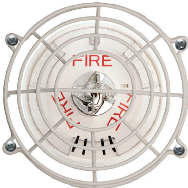
Guard pictured with Wheelock Exceder HSC Strobe Device

Can be used in a variety of applications.