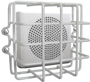
Guard pictured with Wheelock E50 Speaker

Can be used in a variety of applications.