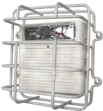
Guard pictured with Wheelock AS-24MCW A/V Signal Appliance