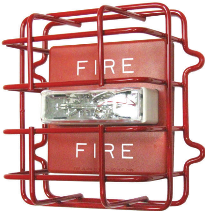
Guard pictured with Wheelock RSS Series Multi-candela Strobe