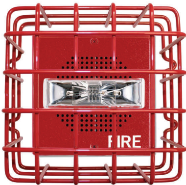
Guard pictured with Wheelock E70 Series Speaker Strobe